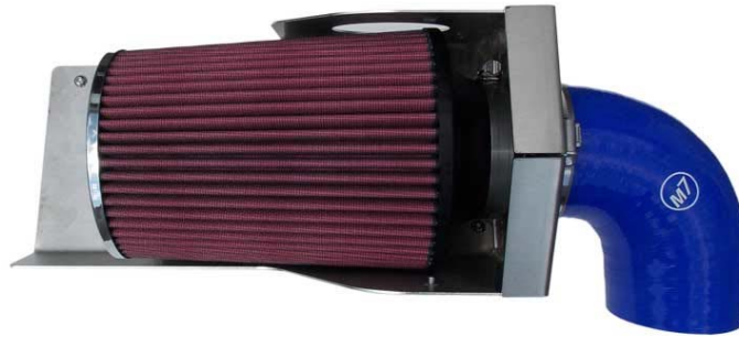
Pleated Filter Shown