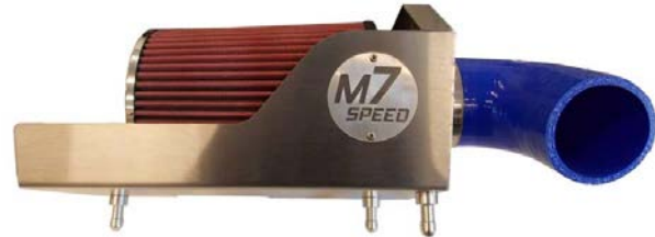
Pleated Filter Shown

FOR YOUR SAFETY INSTALL THIS PRODUCT ONLY WHEN THE ENGINE IS COLD. THIS WILL PROTECT YOU FROM INJURY AND DAMAGE TO YOUR ENGINE & COMPONENTS.