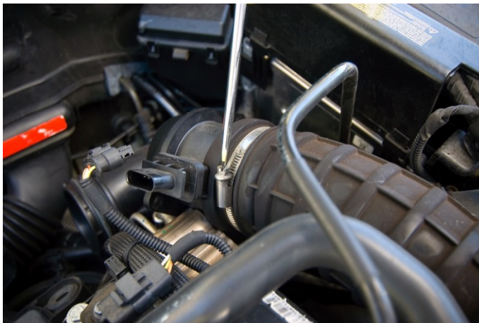
MAF Sensor Clamp