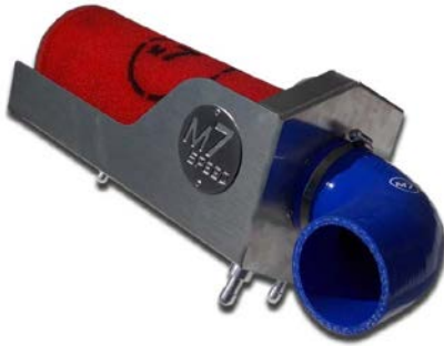
Foam Filter Shown