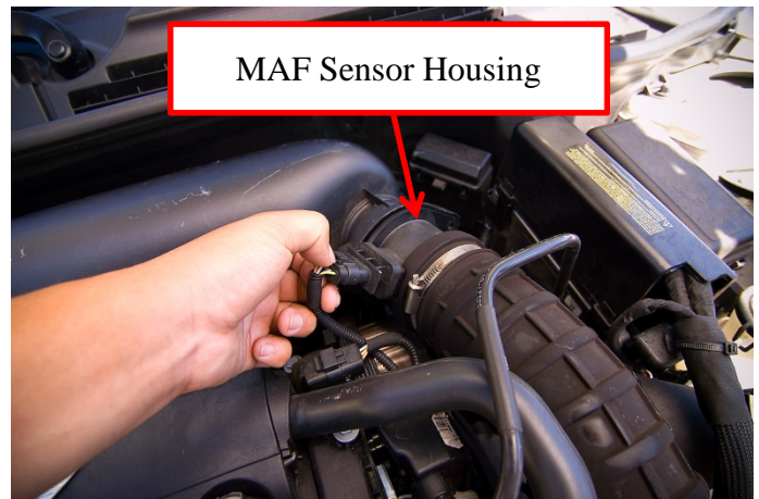
MAF Sensor Connector