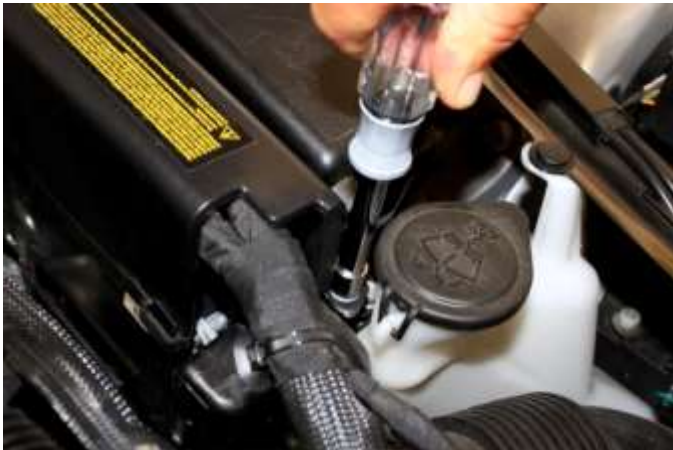
2. Remove the 10mm Hex screw securing ECU cover.