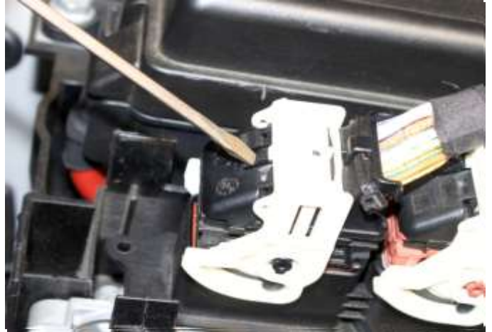
4. Push in locking tap on electrical connector, then rotate latch 90° down to unlock. Do the same for the other (2) connectors.