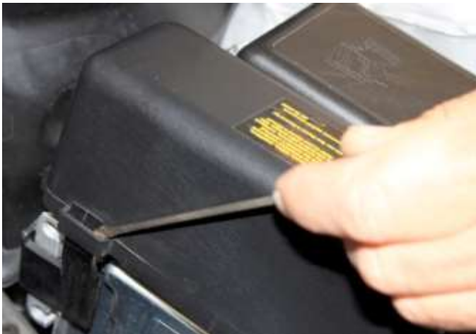
3. Use screwdriver to release the locking tabs. Depending on the model MINI there are 2 or 4 tabs holding the cover in place on either or both sides.