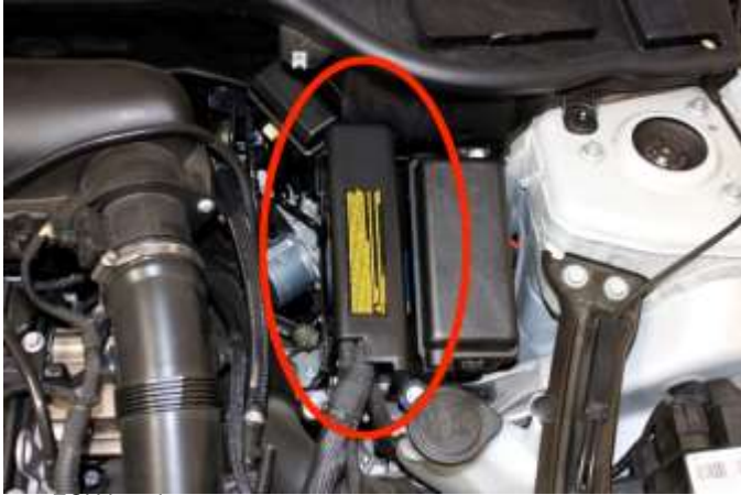
1. ECU location.

TOOLS REQUIRED: [1] Small Screwdriver [1] 10mm Nut Driver or Socket